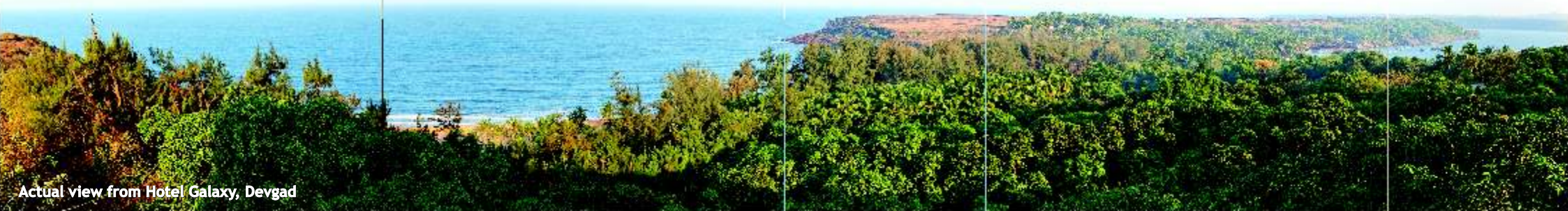
Actual view from Hotel Galaxy, Devgad

At post Devgad, Dist. Sindhudurg, Maharashtra. M - 9422584022 • e: galaxydevgad@gmail.com | www.hotelgalaxydevgad.com